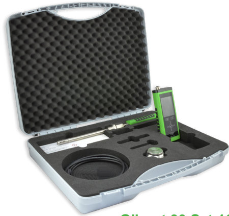
Oilport 30 Set-1C01

The optional calibration kit is used for easy 1 and 2 point adjustment of the a_w reading.