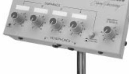
HR-6 Personal Headphone Mixer

The HR-6 is a compact six-channel, five-pot remote mixer that clamps to any mic stand. When used with the HDS-6, the HR-6 allows musicians to customize their own headphone or monitor mix, and the engineer doesn't have to touch the board.